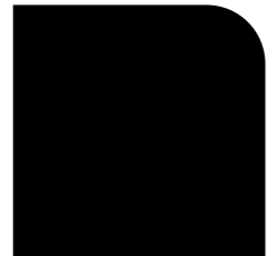
Ebony SA 0.96 | SRI 0