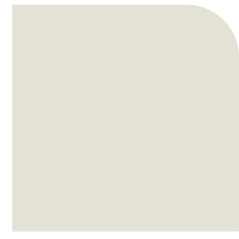
Off White SA 0.38 | SRI 81