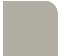
Birch SA 0.47 | SRI 62