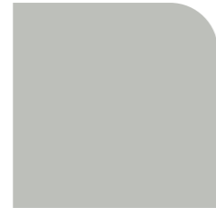
Gull Grey SA 0.43 | SRI 68