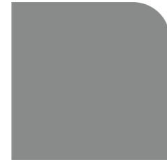
Stony Brook SA 0.57 | SRI 48