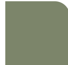
Mist Green SA 0.60 | SRI 45