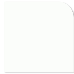
Hamptons White SA 0.27 | SRI 90