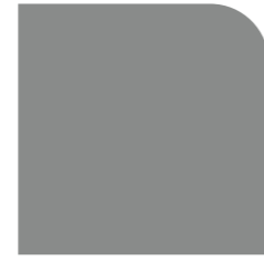
Stony Brook SA 0.57 | SRI 48