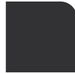
Monolith SA 0.73 | SRI 28