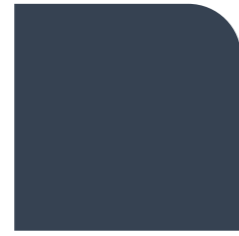
Mountain Blue SA 0.75 | SRI 25