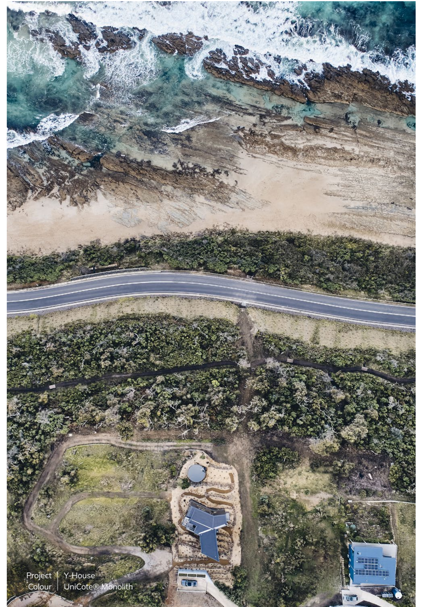
Project | Y-House Colour | UniCote® Monolith

To apply for a warranty for your home, visit unicote.com.au/warranty