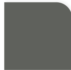
Basal Matt SA 0.71 | SRI 29