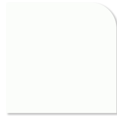
Hamptons White SA 0.27 | SRI 90