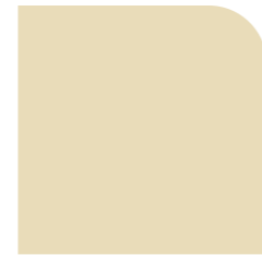
Smooth Cream SA 0.37 | SRI 76