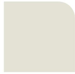
Off White SA 0.38 | SRI 81