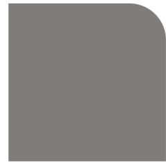
Wallaroo SA 0.64 | SRI 39