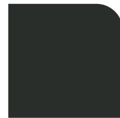
Monolith Matt SA 0.79 | SRI 19