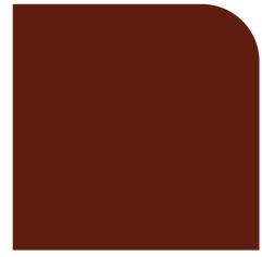
Heritage Red SA 0.74 | SRI 26

Essential colour range available in: UniCote® Select UniCote® Coastal UniCote® Extreme