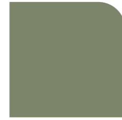
Mist Green SA 0.60 | SRI 45