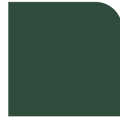
Caulfield Green SA 0.75 | SRI 25